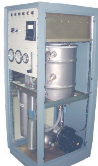
80 kW Liquid-to-Liquid Heat Exchanger