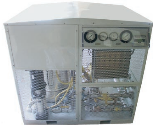
160 kW Liquid-to-Liquid Heat Exchanger