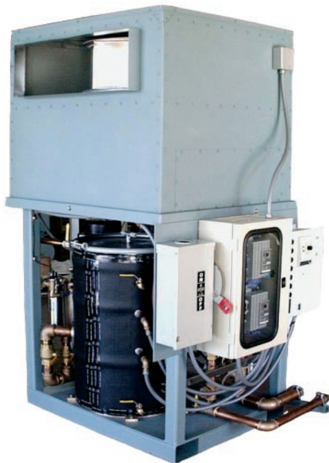
35 kW Liquid-to-Air Heat Exchanger

* LIQUID-TO-LIQUID * ACTIVE REFRIGERATION * LIQUID-TO-AIR *