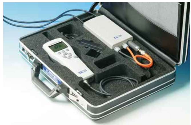
The GM70 in pump-aspirated mode is used for example to check incubators in the field.

CARBOCAP® is a registered trademark of Vaisala. Specifications subject to change without prior notice. ©Vaisala Oyj